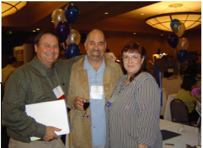
Supplier Showcase 2004